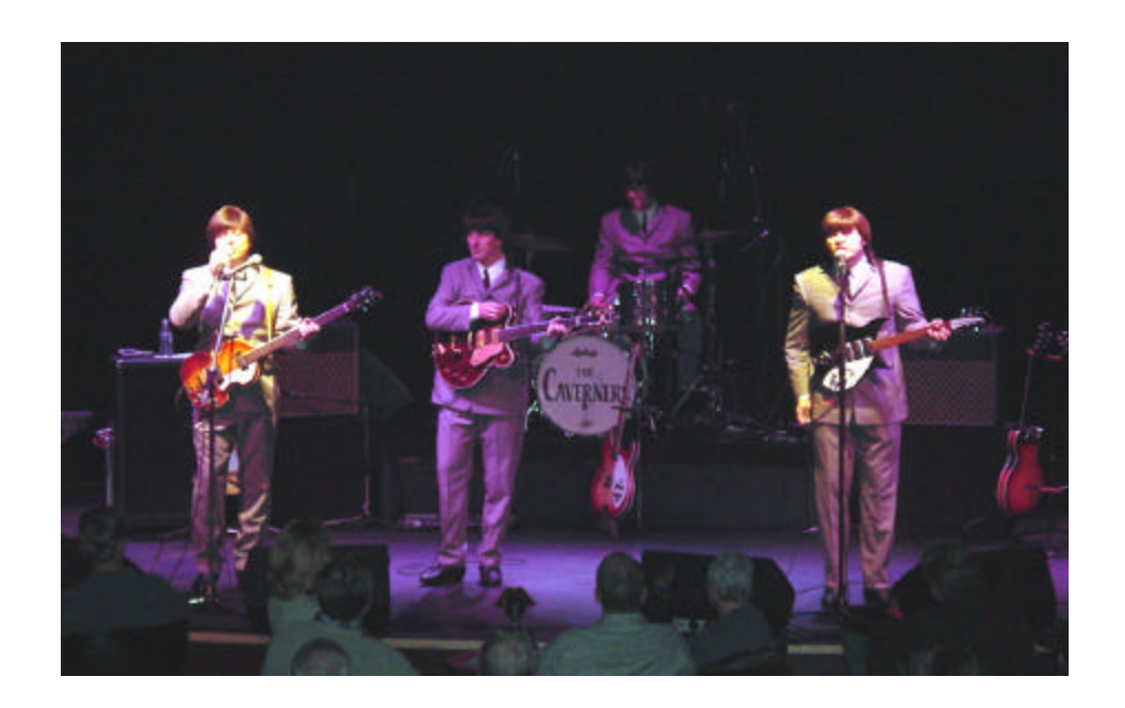
The Caverners Beatles Tribute